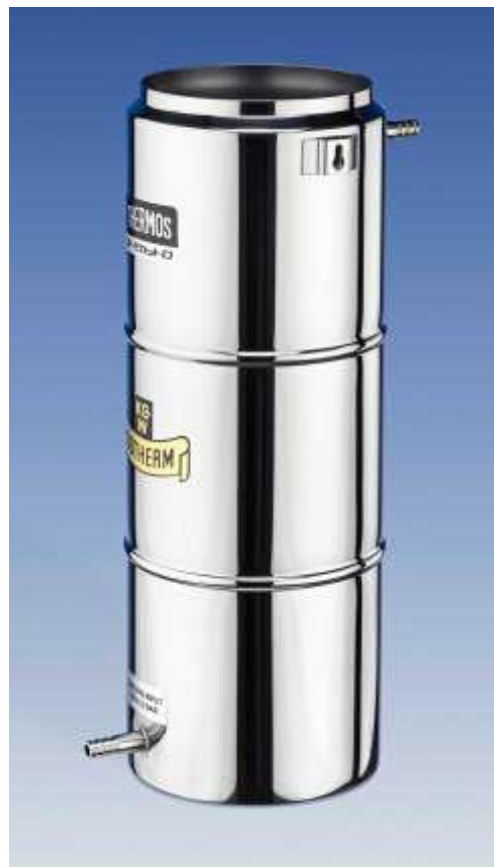
Tempering beaker type TSS-G